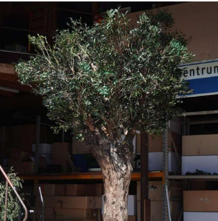
Olive tree 300 centimeters (H)