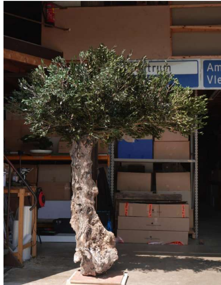
Olive tree, 270 centimeters (H)