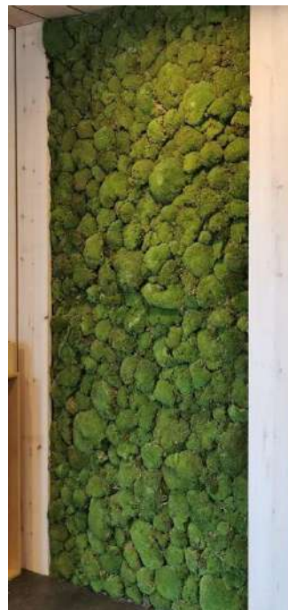
L: Moss wall with pole moss only