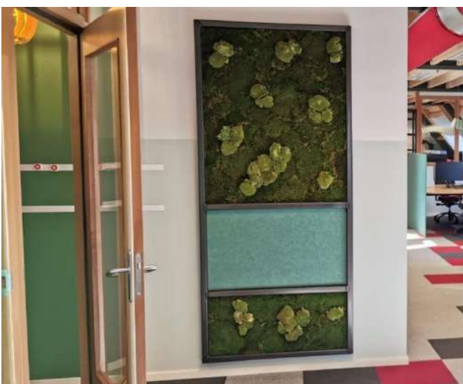
Moss wall with flat moss and pole moss