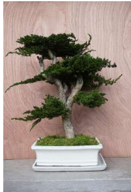
Juniperus Bonsai approx. 55 centimeters (H)