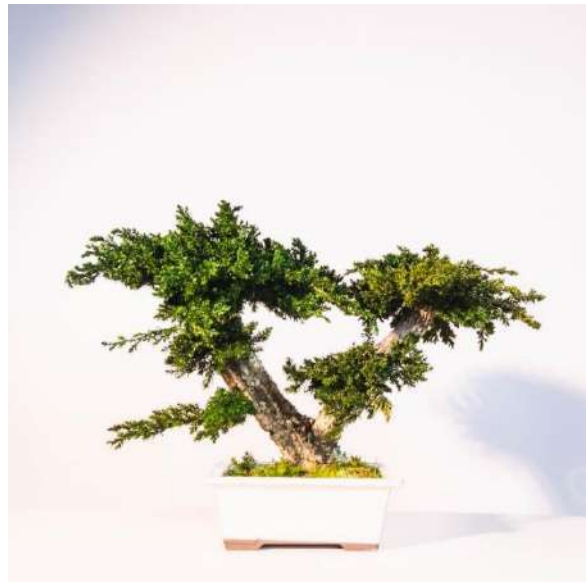
Juniperus Bonsai with two trunks approx. 40 centimeters (H)

Ranging from 20 – 80 centimeters in height