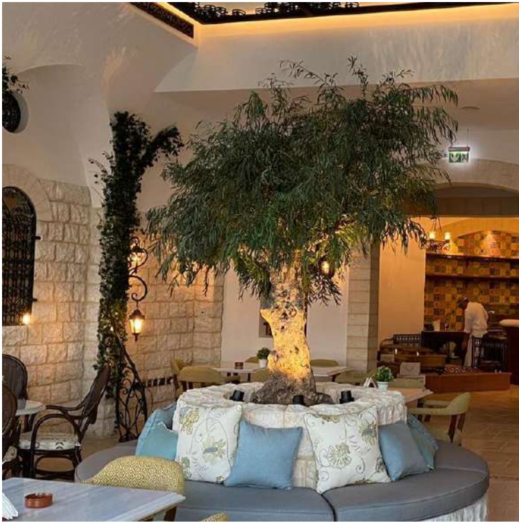
Olive tree, 220 centimeters (H)

Ranging from 200 – 350 centimeters in height