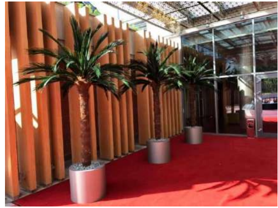
Phoenix palm tree, 300 centimeters (H)

Ranging from 200 centimeters up to 10 meters in height.