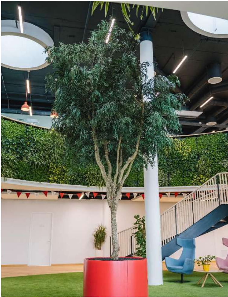
Eucalyptus tree, 550 centimeters (H)