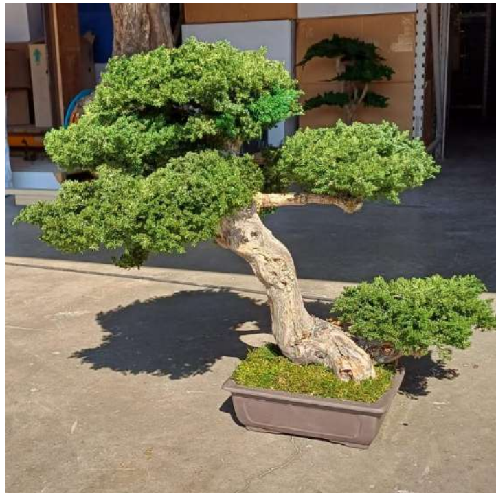
Juniperus Bonsai with wide trunk approx. 60 centimeters (H)