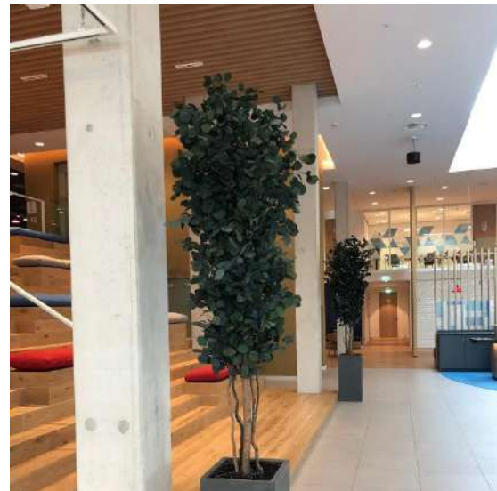
Populus tree, 250 centimeters (H)