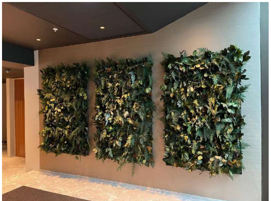
Green walls, only with leaves