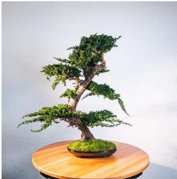
Juniperus Bonsai approx. 50 centimeters (H)