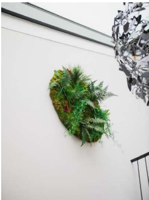
Round Green wall with moss and leaves

Any dimensions desired, to the millimeter.