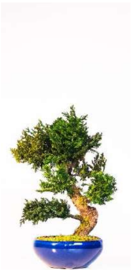
Juniperus Bonsai approx. 35 centimeters (H)