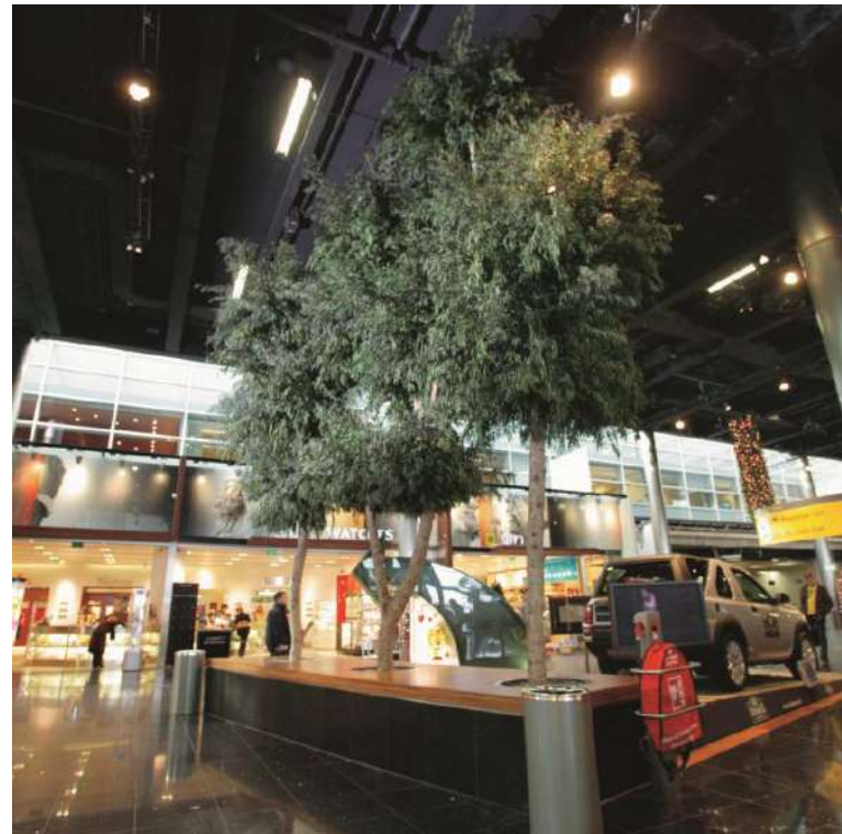
Olive tree, approx. 250 centimeters (H)