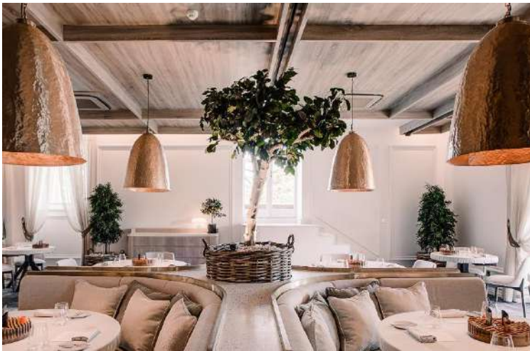
Salal tree, 200 centimeters (H)