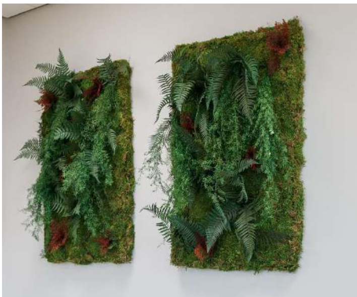
Green wall with moss and leaves