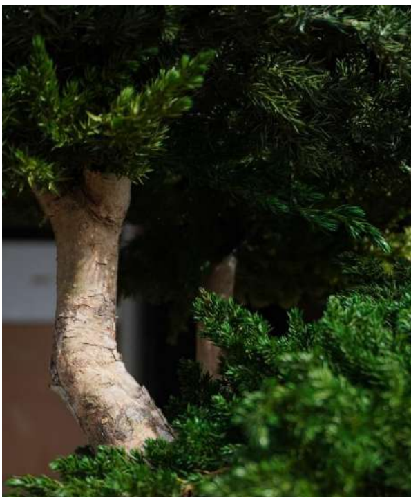
Details of the Juniperus leaves and trunk