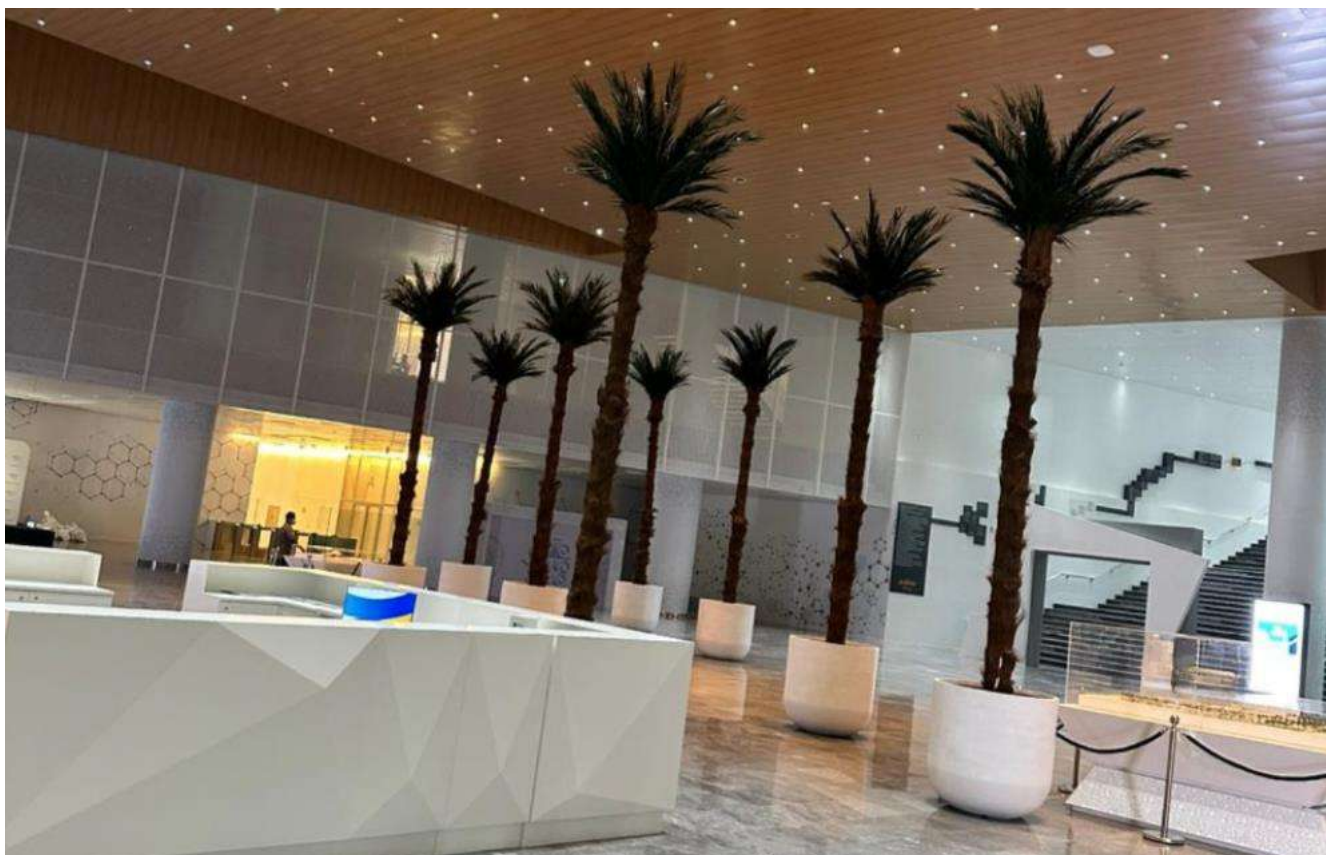
Phoenix palm trees, 600 centimeters (H)